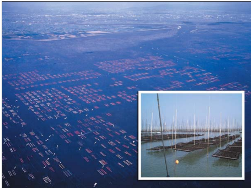
Figure 3. Approximately 20% of the surface area of Ariake Sound, Japan is currently in nori (edible red algae) culture, a figure that will potentially double by the end of the century. Recent land reclamation and water diversion schemes in the inner Sound have negatively affected aquaculture and shell fisheries, establishing new conflicts among “sea farming” and other human uses.

management (ICZM) addresses these issues by considering the broader “problem-shed” (the area that encompasses all of the affected stakeholders), and is designed to manage competing uses (Figure 3). Its success depends on the ability to create new paradigms that will resolve the growing tensions among the involved communities.