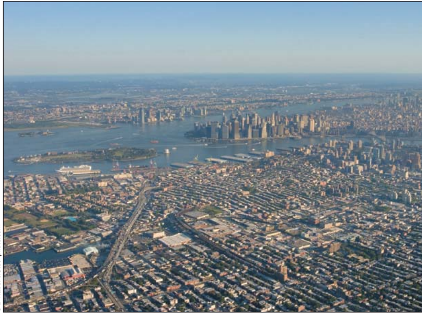
Figure 1. New Jersey–New York Harbor, with its attendant ports, commerce, intermodal transportation, and other human activities, is a classic example of mankind's dependence on the coastal zone.

borne trade, sea farming, and the effects of climate change accelerate (Figure 2). Society has yet to adequately address the challenge of coastal resource management in today's world, i.e. by facing changes that make sustainability more feasible technologically, but at the same time more difficult politically and economically. First, there has been a dramatic growth in per capita domestic product in many regions of the globe and an increased ability to meet human needs. Second, despite recent successes in decreasing harmful consumption per unit value of product, worldwide consumption of energy and other natural resources in industrialized nations continues to accelerate (Kates and Parris 2003).