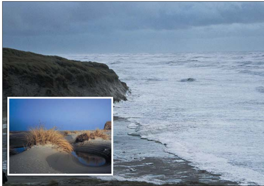
Figure 4. An ecosystem-based management (EBM) and ocean zoning approach to managing coastal resources may help preserve and conserve ecosystems relatively uninfluenced by human activities, such as in this region of the Dutch Wadden Sea.

Even a cursory examination of the published literature reveals the sometimes large divide between ecocentrists and anthropocentrists, scholars and practitioners, functionalists and compositionists (Callicott et al. 1999), environmental organizations and industry, commercial